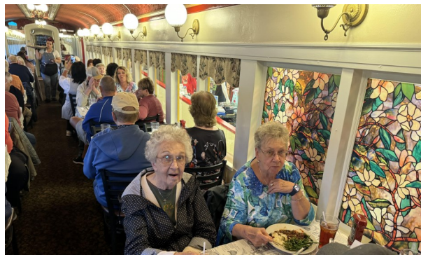
While we were in Amish Country, we took a train ride and enjoyed a wonderful meal. We also had a horse and buggy ride to visit an Amish farm. Our weather was wonderful and so was the food.