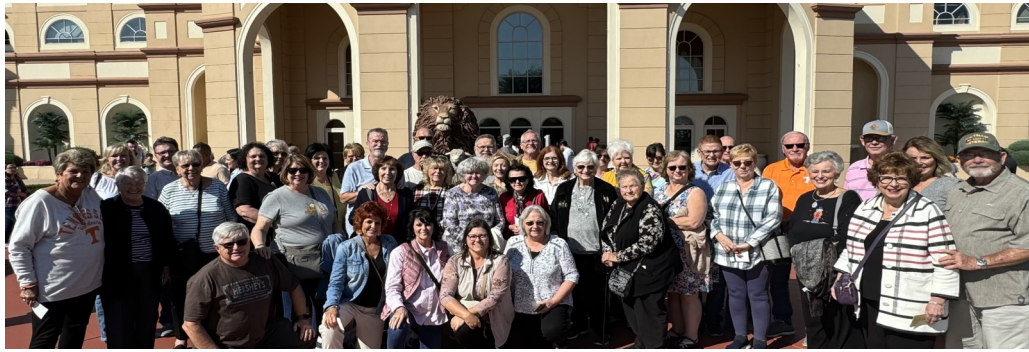
Our Super Partners in Lancaster to see the production of “Daniel” at the Sight and Sound Theatre